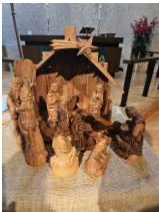
Christmas In July (July 30)